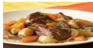
Roast Beef with Carrots & Potatoes Key Lime Pie